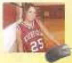
Laptops Laptops para regalo

NUEVO! photogifts.lifetouch.com Agéndalo ahora y cuando recibas tus fotos, entra en internet y crea estupendos regalos fotográficos. Además puedes compartirlas en línea sin cargo!